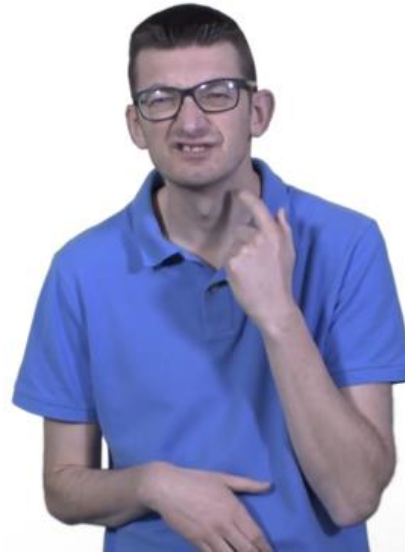
Niels wil nog niet slapen Marcus Pfister